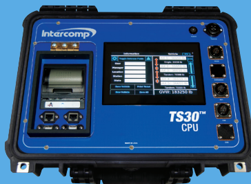
TS30™ WIM CPU

Provides the ability to process weight-related data and is self-enclosed with a thermal printer in a rugged, all-weather case for use in even the most remote locations. Collect and totalize axle weight, gross weight, vehicle ID & class for reporting and data collection.