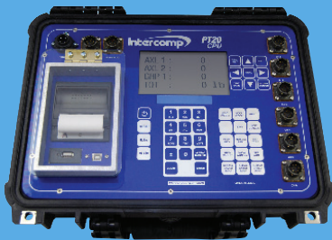
PT20™ WIM CPU

Provides the ability to process weight-related data and is self-enclosed with a thermal printer in a rugged, all-weather case for use in even the most remote locations. Collect and totalize axle weight, gross weight, vehicle ID & class for reporting and data collection.